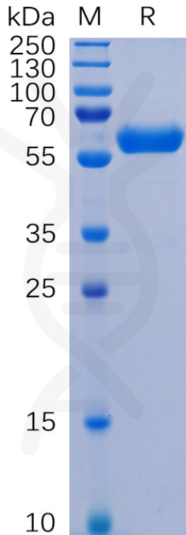
Figure 1. SARS-CoV-2 (2019-nCoV) S protein RBD, hFc Tag on SDS-PAGE under reducing condition.