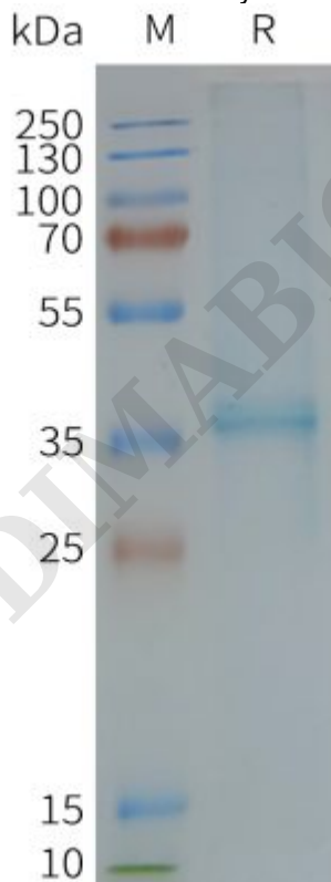
Figure2. Human XCR1-Nanodisc, Flag Tag on SDS-PAGE