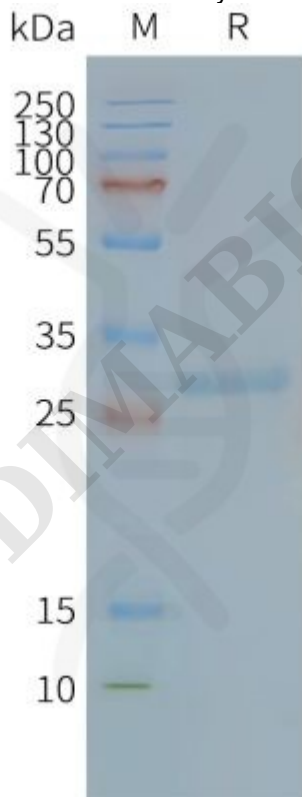
Figure2. Human TSPAN8-Nanodisc, Flag Tag on SDS-PAGE