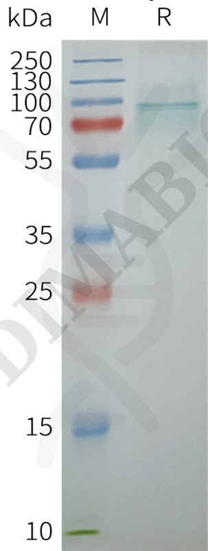
Figure2. Human TRPV6-Nanodisc, Flag Tag on SDS-PAGE