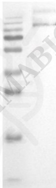
Figure2. WB analysis of Human TRPV1-Nanodisc with anti-Flag monoclonal antibody at 1/5000 dilution, followed by Goat Anti-Rabbit IgG HRP at 1/5000 dilution