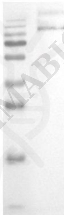
Figure2. WB analysis of Human TRPV1-Nanodisc with anti-Flag monoclonal antibody at 1/5000 dilution, followed by Goat Anti-Rabbit IgG HRP at 1/5000 dilution