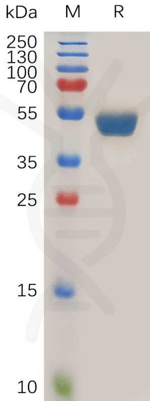
Figure 1. Human TNFSF15 Protein, N-hFc Tag on SDS-PAGE under reducing condition.