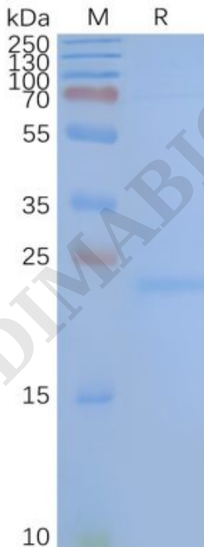
Figure2. Human TM4SF1-Nanodisc, Flag Tag on SDS-PAGE