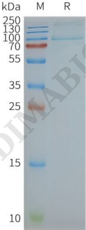
Figure2. Human TLR2-Nanodisc, Flag Tag on SDS-PAGE