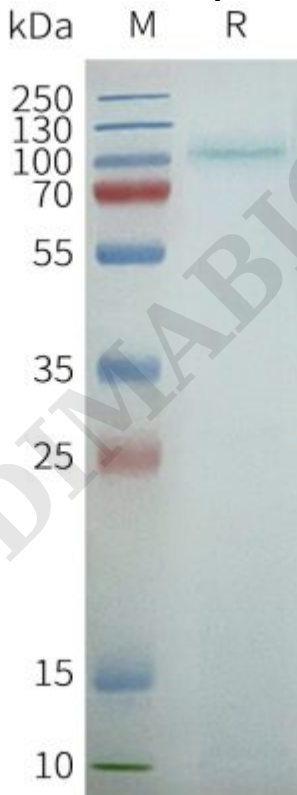
Figure2. Human TAS1R2-Nanodisc, Flag Tag on SDS-PAGE