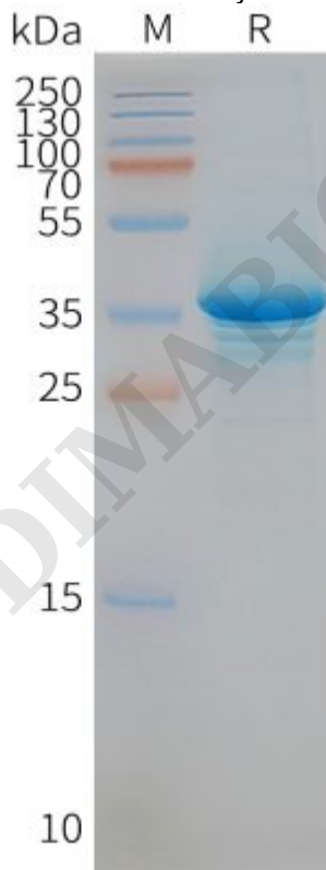
Figure2. Human STEAP1-Nanodisc, Flag Tag on SDS-PAGE