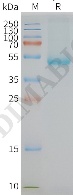
Figure 2. Human SLC7A11-Nanodisc, Flag Tag on SDS-PAGE