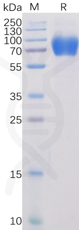
Figure 1. Human SLAMF1 Protein, mFc-His Tag on SDS-PAGE under reducing condition.