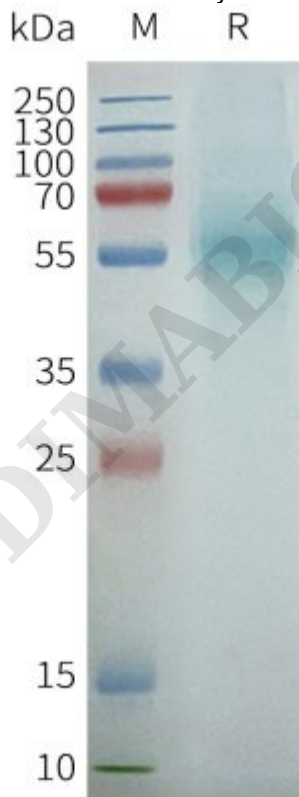
Figure2. Human PTGER4-Nanodisc, Flag Tag on SDS-PAGE