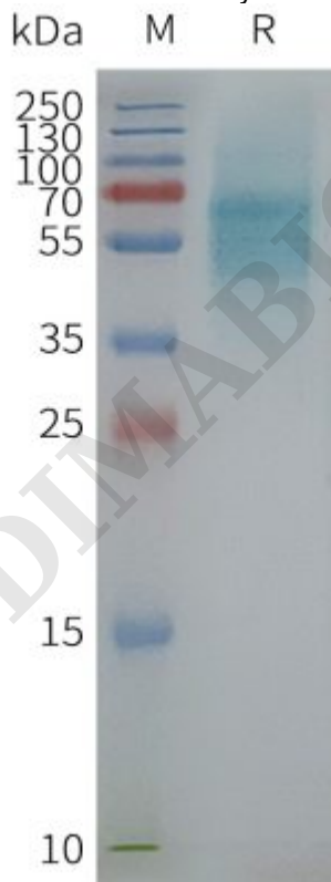
Figure2. Human PROKR1-Nanodisc, Flag Tag on SDS-PAGE