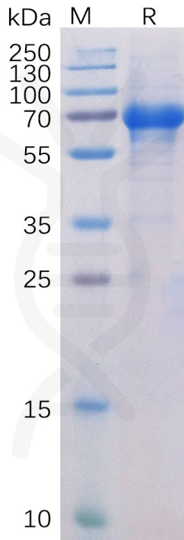
Figure 1. Human OX40 Protein, hFc-His Tag on SDS-PAGE under reducing condition.