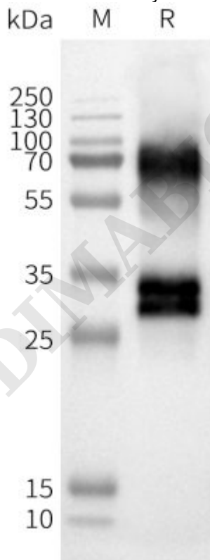
Figure2. WB analysis of Human OR52D1-Nanodisc with anti-Flag monoclonal antibody at 1/5000 dilution, followed by Goat Anti-Rabbit IgG HRP at 1/5000 dilution