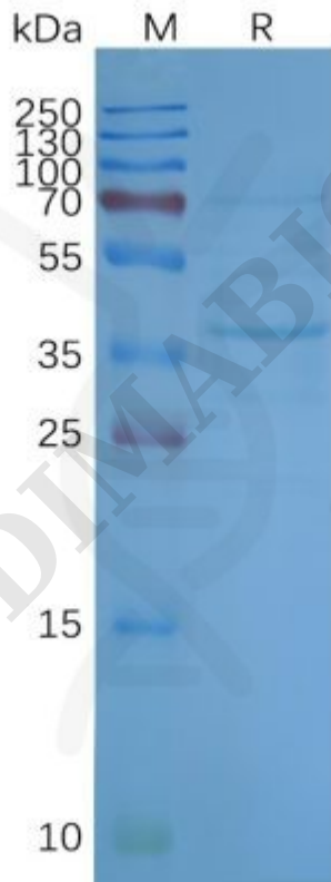
Figure2. Human OR2H1-Nanodisc, Flag Tag on SDS-PAGE