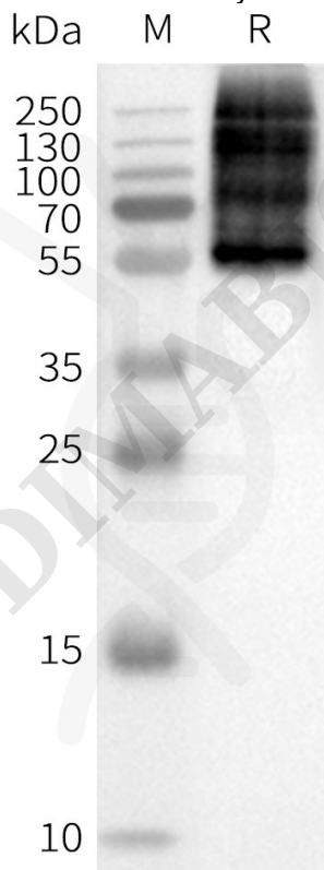
Figure 2. WB analysis of Human OPRM-Nanodisc with anti-Flag monoclonal antibody at 1/5000 dilution, followed by Goat Anti-Rabbit IgG HRP at 1/5000 dilution