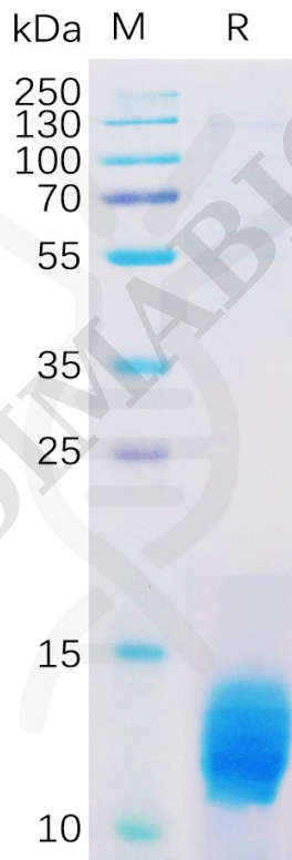
Figure 1. Human MUC1 Protein, His Tag on SDS-PAGE under reducing condition.