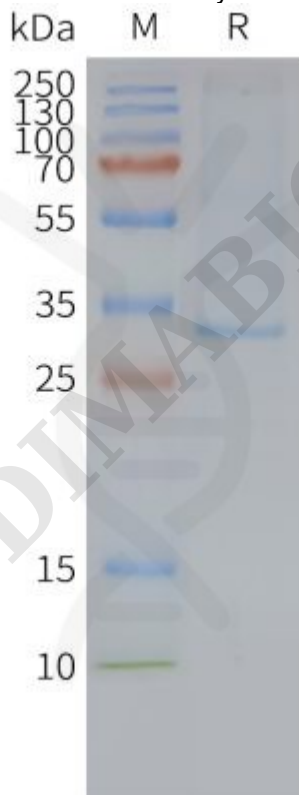
Figure2. Human MRGPRX2-Nanodisc, Flag Tag on SDS-PAGE