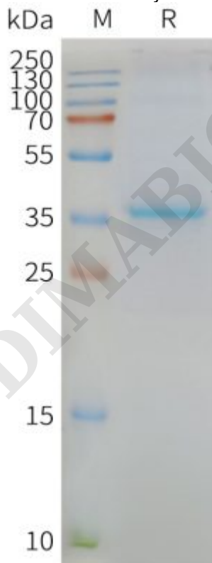
Figure2. Human MLC1-Nanodisc, Flag Tag on SDS-PAGE