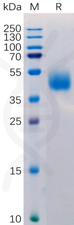
Figure 1. Human MICB Protein, His Tag on SDS-PAGE under reducing condition.