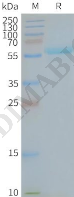
Figure2. Human MFSD13A-Nanodisc, Flag Tag on SDS-PAGE