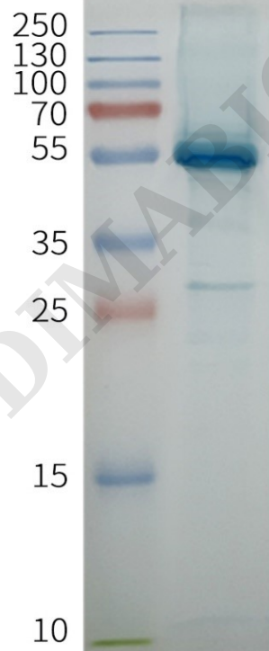
Figure 2. Human MBP-CLDN6-Nanodisc with N-MBP Tag, C-Flag Tag on SDS-PAGE