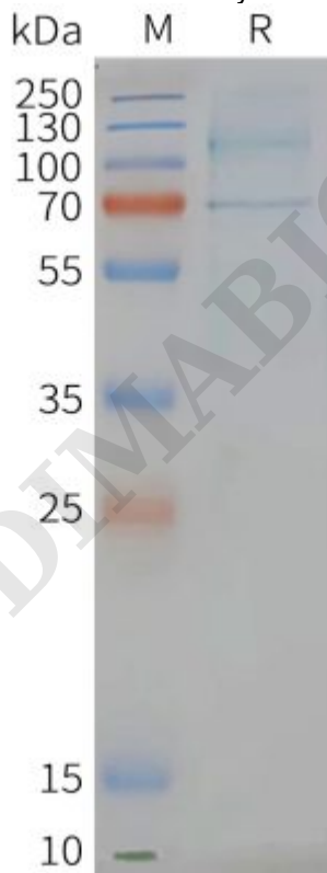
Figure2. Human LGR6-Nanodisc, Flag Tag on SDS-PAGE