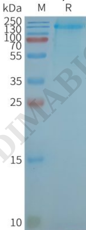
Figure2. Human LGR4-Nanodisc, Flag Tag on SDS-PAGE