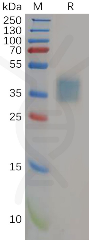
Figure 1. Human IL21R Protein, His Tag on SDS-PAGE under reducing condition.