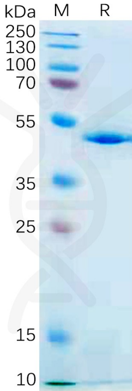
Figure 1. Human IL21 Protein, hFc Tag on SDS-PAGE under reducing condition.