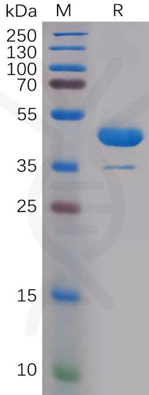
Figure 1. Human IL1A Protein, hFc Tag on SDS-PAGE under reducing condition.