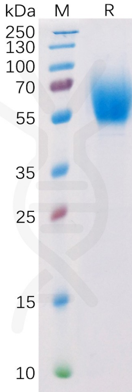
Figure 1. Human IL13RA1 Protein, His Tag on SDS-PAGE under reducing condition.