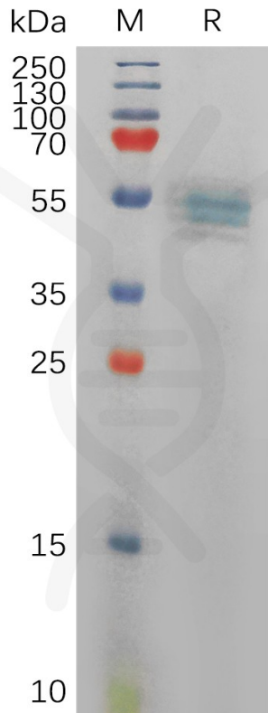
Figure 1. Human IL12B Protein, His Tag on SDS-PAGE under reducing condition.