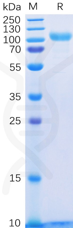
Figure 1. Human HER3 Protein, His Tag on SDS-PAGE under reducing condition.