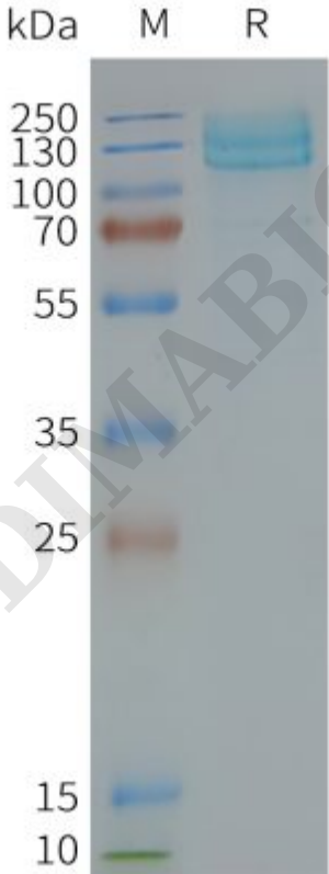
Figure2. Human GRM7-Nanodisc, Flag Tag on SDS-PAGE