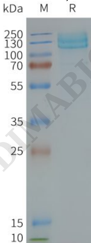
Figure2. Human GRM7-Nanodisc, Flag Tag on SDS-PAGE