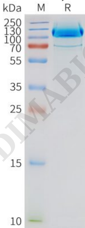
Figure2. Human GRM2-Nanodisc, Flag Tag on SDS-PAGE