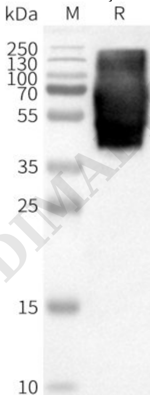
Figure2. WB analysis of Human GPR84-Nanodisc with anti-Flag monoclonal antibody at 1/5000 dilution, followed by Goat Anti-Rabbit IgG HRP at 1/5000 dilution