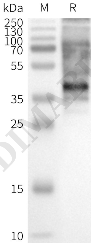
Figure 2. WB analysis of Human GPR65-Nanodisc with anti-Flag monoclonal antibody at 1/5000 dilution, followed by Goat Anti-Rabbit IgG HRP at 1/5000 dilution