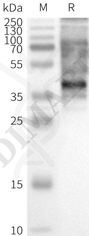
Figure 2. WB analysis of Human GPR65-Nanodisc with anti-Flag monoclonal antibody at 1/5000 dilution, followed by Goat Anti-Rabbit IgG HRP at 1/5000 dilution