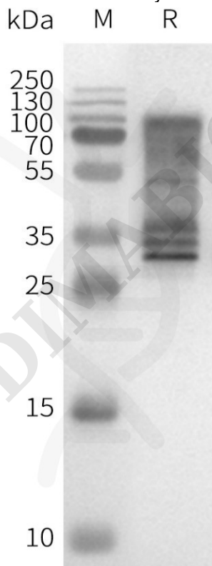
Figure 2. WB analysis of Human GNRHR-Nanodisc with anti-Flag monoclonal antibody at 1/5000 dilution, followed by Goat Anti-Rabbit IgG HRP at 1/5000 dilution