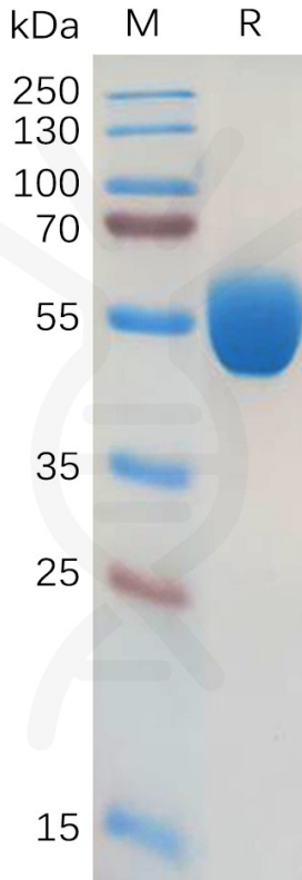
Figure 1. Human GM-CSF Protein, hFc Tag on SDS-PAGE under reducing condition.