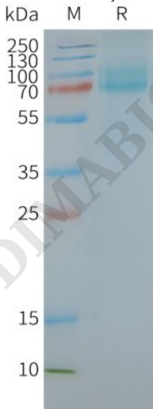
Figure2. Human FZD10-Nanodisc, Flag Tag on SDS-PAGE