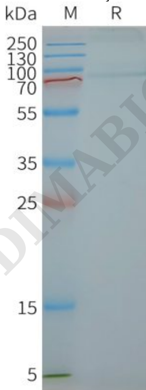
Figure2. Human FSHR-Nanodisc, Flag Tag on SDS-PAGE