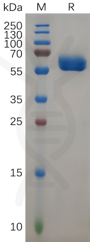
Figure 1. Human FOLR2 Protein, hFc Tag on SDS-PAGE under reducing condition.