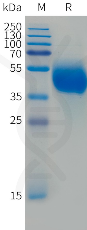
Figure 1. Human FCRL5(745-847) Protein, hFc Tag on SDS-PAGE under reducing condition.