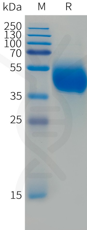
Figure 1. Human FCRL5(745-847) Protein, hFc Tag on SDS-PAGE under reducing condition.