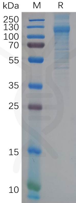
Figure 1. Human FCRL5 Protein, His Tag on SDS-PAGE under reducing condition.