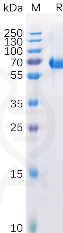
Figure 1. Human EPHA2 Protein, His Tag on SDS-PAGE under reducing condition.