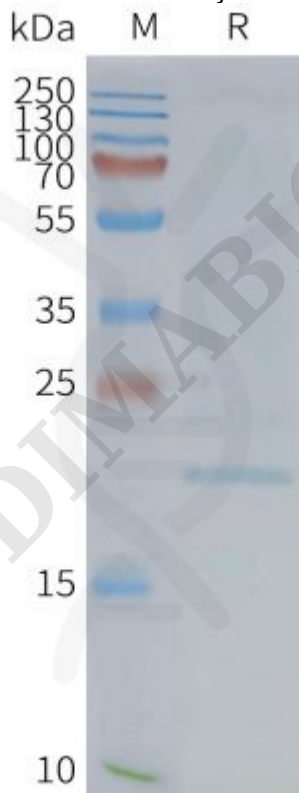
Figure2. Human EMP2-Nanodisc, Flag Tag on SDS-PAGE