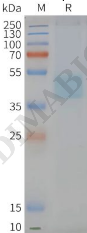
Figure2. Human CXCR6-Nanodisc, Flag Tag on SDS-PAGE