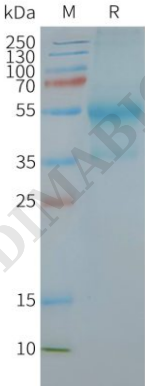
Figure2. Human CXCR4-Nanodisc, Flag Tag on SDS-PAGE