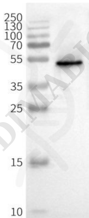
Figure2. WB analysis of Human CXCR3-Nanodisc with anti-Flag monoclonal antibody at 1/5000 dilution, followed by Goat Anti-Rabbit IgG HRP at 1/5000 dilution