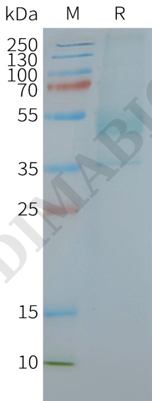
Figure 2. Human CXCR2-Nanodisc, Flag Tag on SDS-PAGE