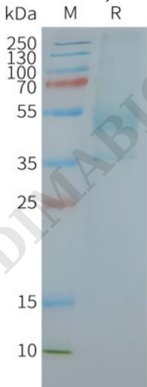
Figure2. Human CXCR2-Nanodisc, Flag Tag on SDS-PAGE