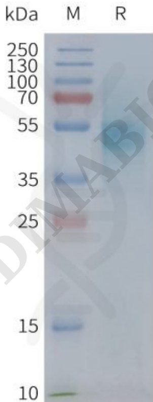
Figure2. Human CXCR1-Nanodisc, Flag Tag on SDS-PAGE